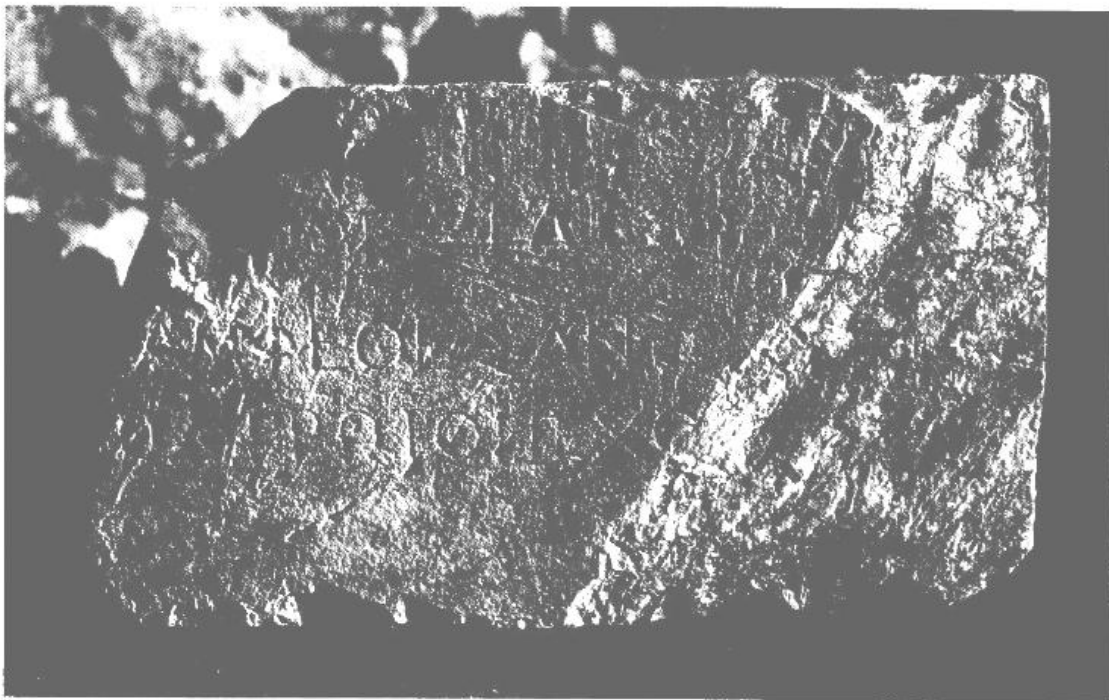
Fig. 3. Il nuovo frammento di CEG 803.